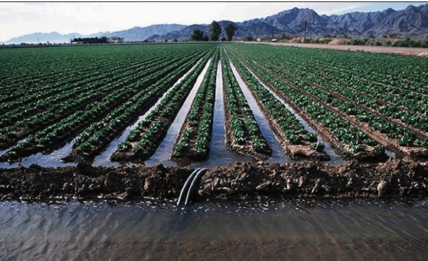
Fig- Different techniques of irrigation