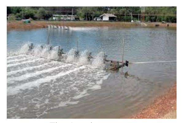
Fig- Aeration system