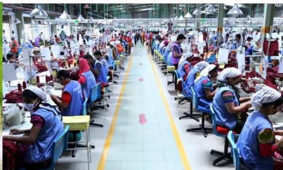
Industry of Bangladesh