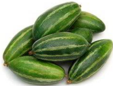
Name: Pointed Gourd