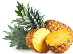
Name: Pine Apple