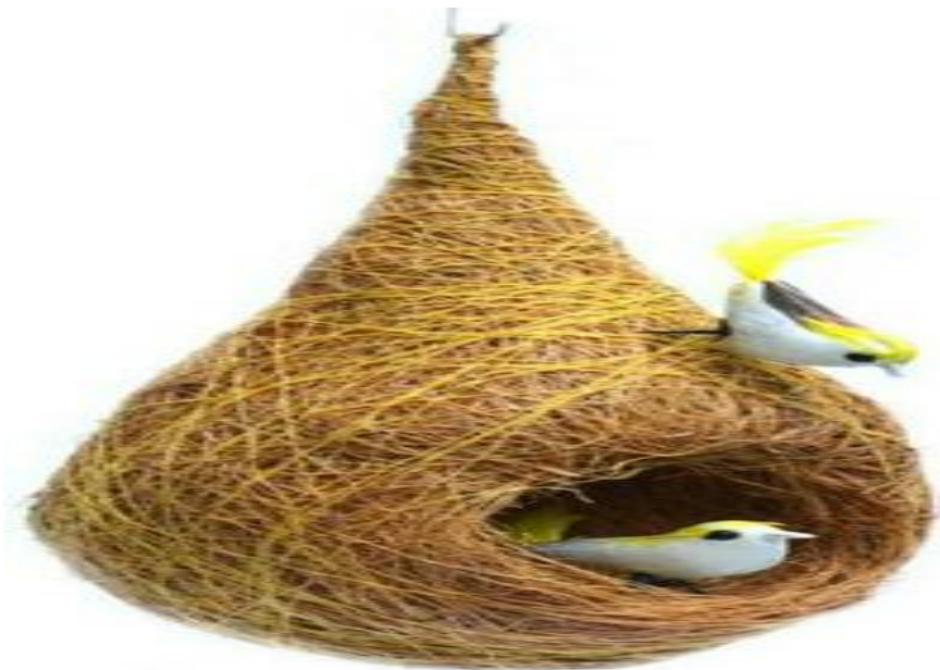
Figure: Birds nest

Nest: Most birds build nests. Some nests are made high up in trees. Others are made on the ground or in buildings.