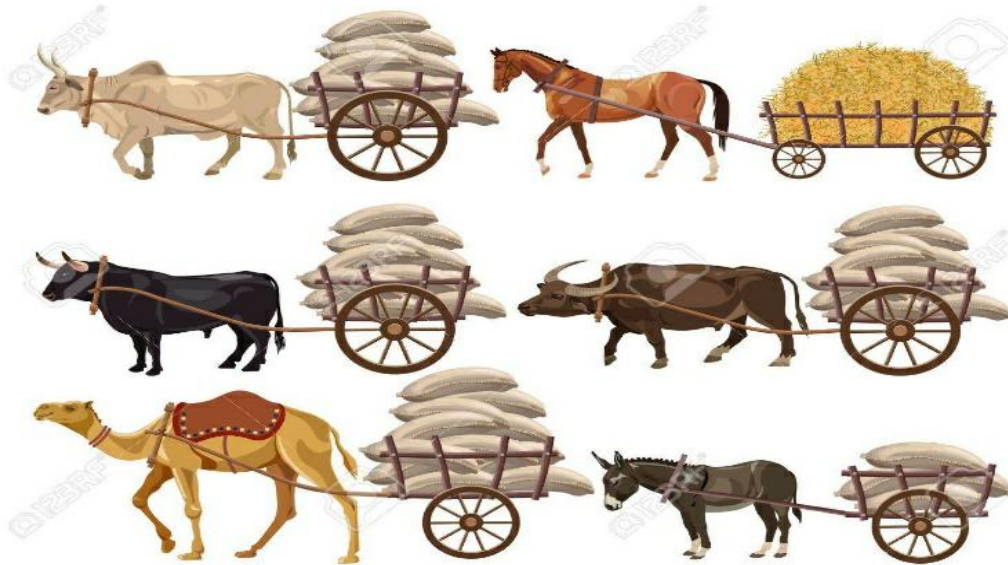
Figure: Beasts of burden

Beasts of burden: some animals carry loads for us. They are called beasts of burden. Donkey, horse, bullocks etc. are beasts of burdens.