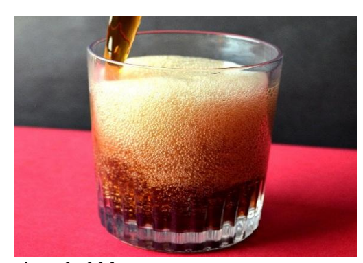
air as bubble