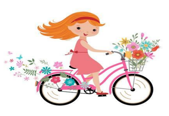
riding a bicycle