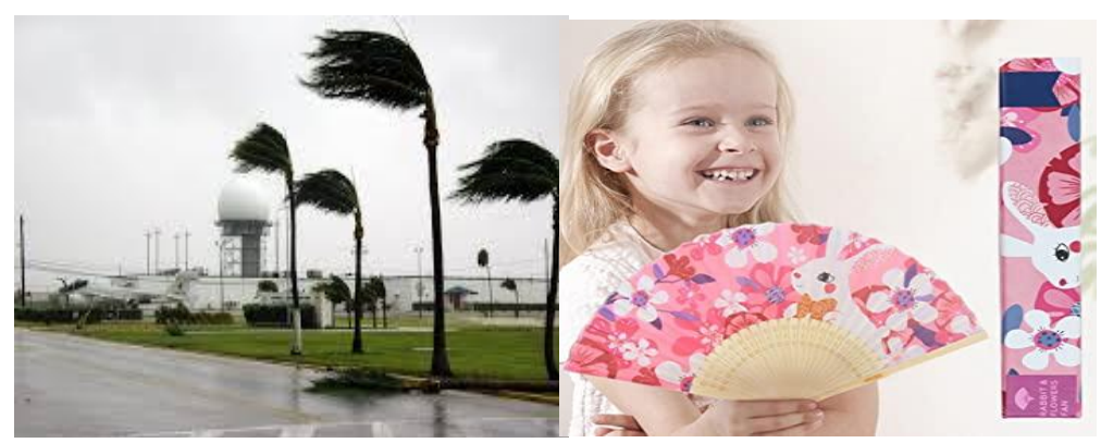
Air can move leaves of treesWhen we use fan