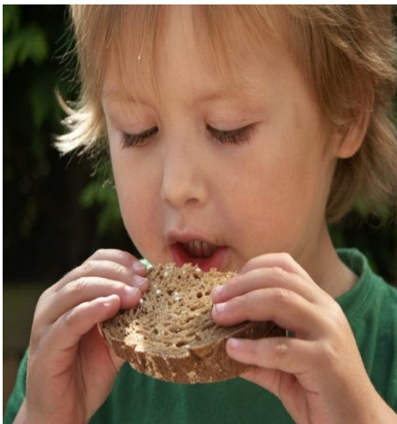
Living things can eat

Living things grow and change through out their life.