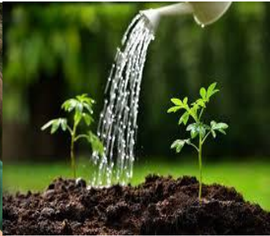
Living things need water to survive