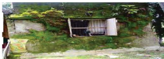
moss on the wall