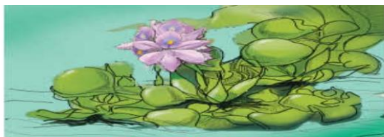
water hyacinth in the water