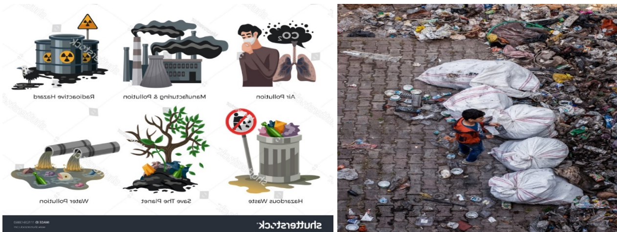
Picture: Ways of environment pollution