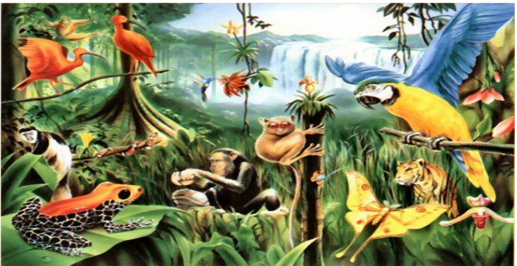
Picture of Natural Environment