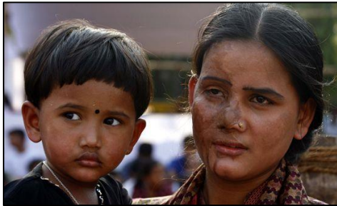
Acid attack survivor with her child in Bangladesh

(Amnesty stands for -----an independent worldwide organization working against human-rights violations and for the release of persons imprisoned for political or religious dissent. Got the Nobel Peace Prize 1977.)