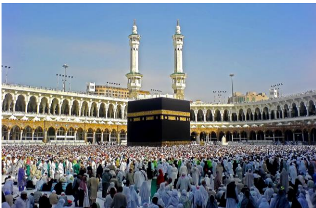
a) The holy place of Kaa'ba Sharif